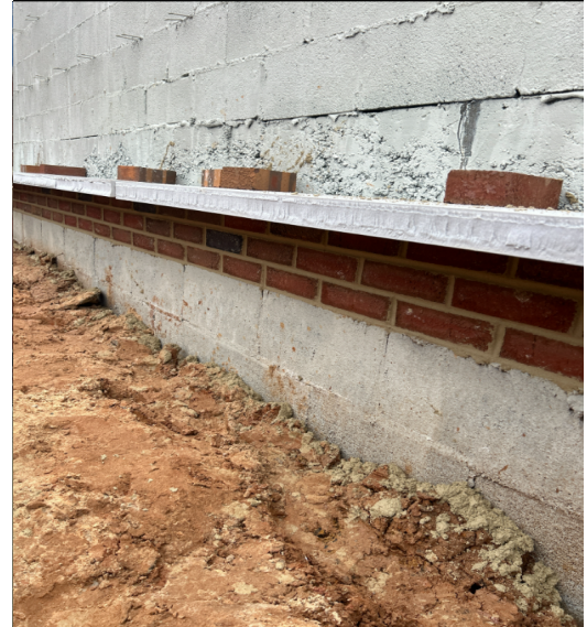
Finish installing brick at the new kitchen addition