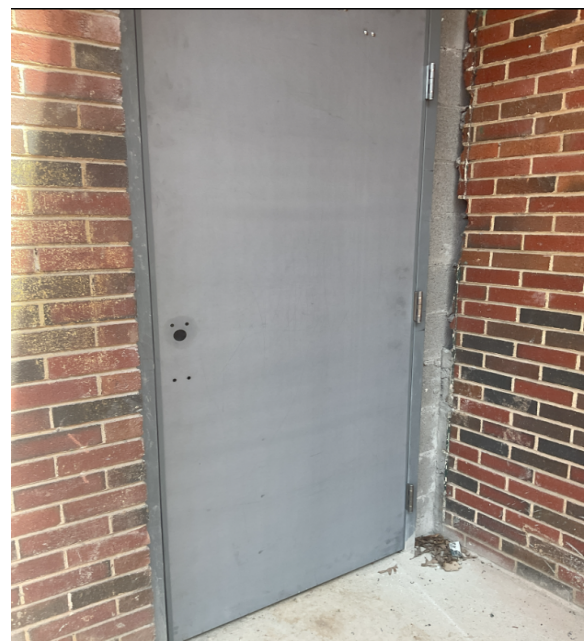
Begin installing hollow metal doors throughout