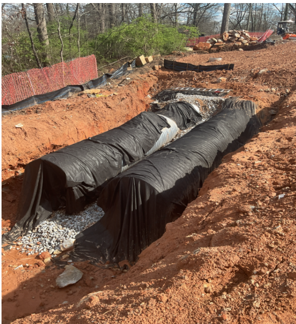
Continue with front detention pond install