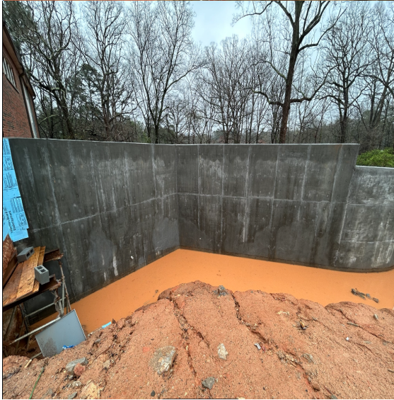
Will begin backfilling retaining wall once the water dries up